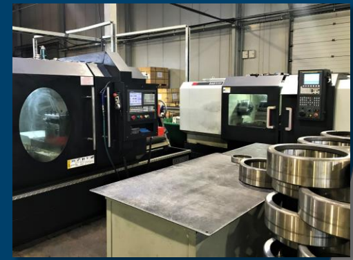
CNC - Computer Numerical Control machine

Automatic quality control of surface quality and geometrical precision